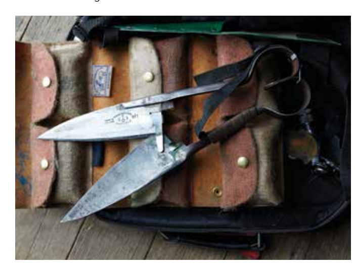
Blade shears: Shearers in the past used hand blades to shear sheep.

Shearers used hand blades (called blade shears) to harvest the wool. Horses, bullocks and camels pulled carts to transport the wool to the ships, which took it to England where it was sold and made into clothes and furnishings.